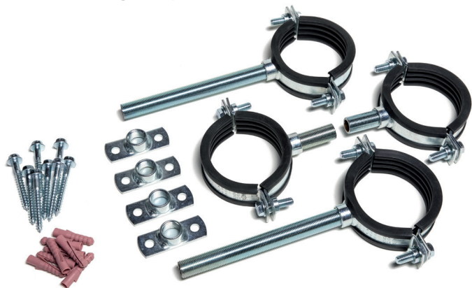
Figure 1: Fastening set for SAVE 97/125

Sturdy, corresponding fastening sets are available for all GEROtherm® SAVE products. These all feature noise-insulating clamps.