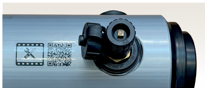
Figure 2: SAVE 125

Every GEROtherm® SAVE collector/distributor features a QR code that links to our assembly video.