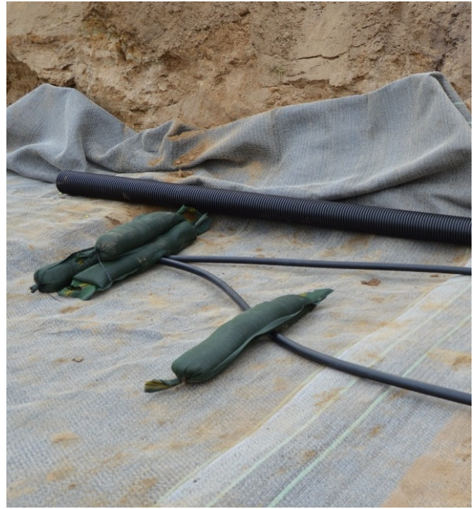
Image 4: GEROtherm® probe as horizontal collector