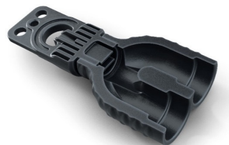
Image 5: Greater load resistance and stability thanks to reinforced walls on probe foot; PN25 Low hydraulic resistance due to large cross-sections and welded coupler sockets