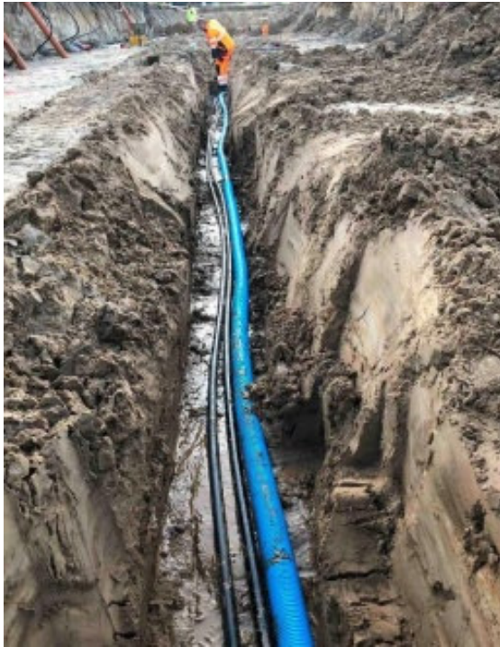
Image 3: GEROtherm® probe alongside wastewater pipe